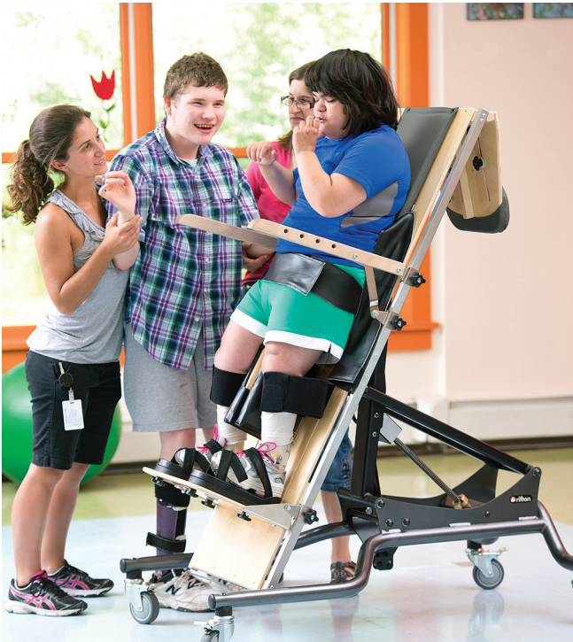
This client has advanced so far that the headrest can now be flipped back out of the way.