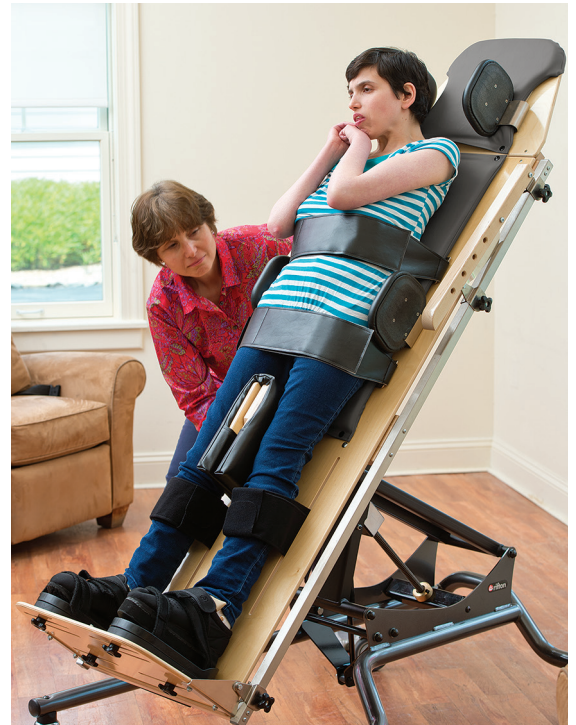
The Supine Stander stays secure at any angle. Turn the crank to gradually increase weight-bearing.